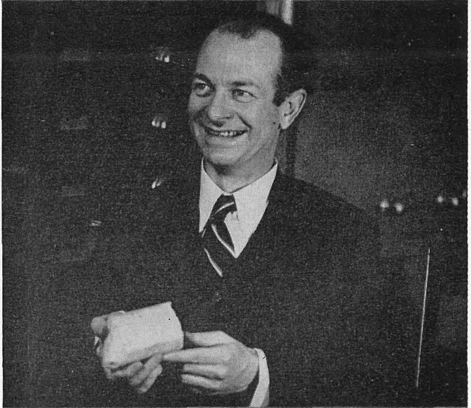
Chemist Pauling: "... with knowledge of atomic structure of biological substances we may hope for a more effective attack on problems of biology and medicine."