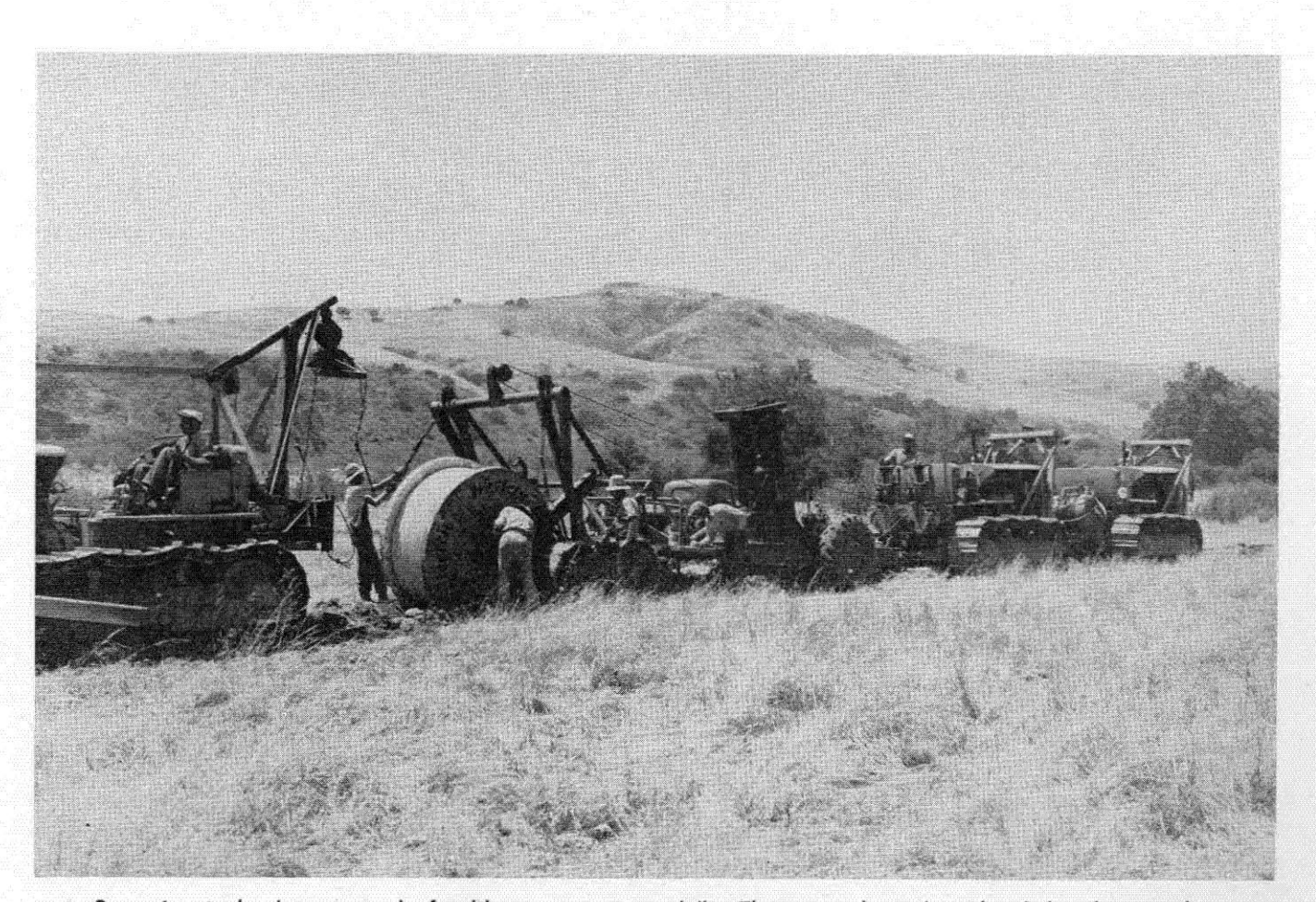
Preparing to load a new reel of cable among western hills. The gas tank on the side of the plow supplies pressure for the oil sprayer.

If the ground is hard or if the cable is to be placed deep, it is necessary to make preliminary cuts through the earth ahead of the plow train. These cuts can be made by the same type of plow as that used to place the cable or by a special rooter. Occasionally it is necessary to make several passes over the same route in order to cut the trench to the proposed cable depth. A trench six