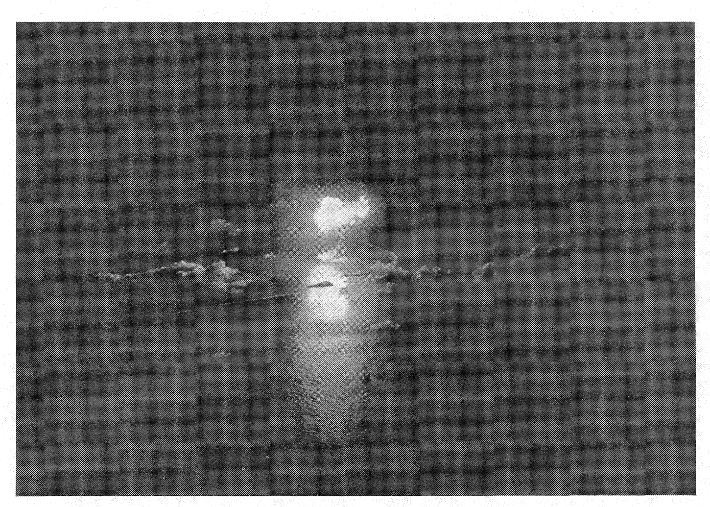
Atomic bomb test at Eniwetok Atoll in 1948-"very encouraging."