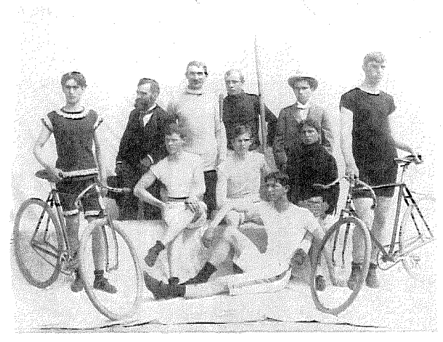
The early days: Throop Institute's cycling club