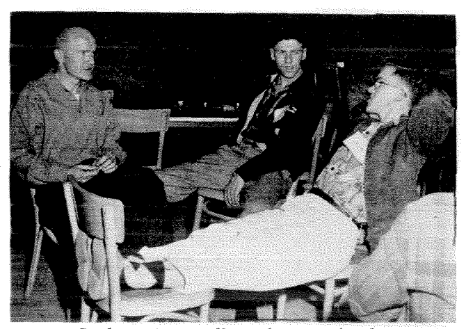
Student tries to sell pet theory to faculty :

without damaging his school, his friends, and himself?