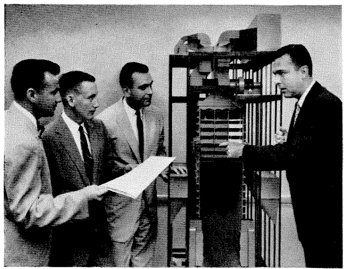
B&W engineers discuss developments in the Universal Pressure Boiler.

Ask your placement officer for a copy of "Opportunities with Babcock & Wilcox" when you arrange your interview with B&W representatives on your campus. Or write, The Babcock & Wilcox Company, Student Training Department, 161 East 42nd Street, New York 17, N. Y.