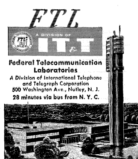
East Coast Laboratory and Microwave Tower

Opportunities for relaxed living and careerbuilding also at FTL's West Coast Laboratories: San Fernando, Cal., 15151 Bledsoe 5t.—openings in Digital Computers, Inertial Navigation Systems and Infra Red Systems. Palo Alto, Cal., 937 Commercial St.—openings in Carrier Systems.