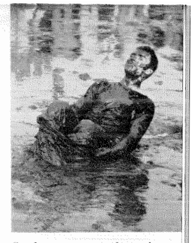
Sophomore goes through stately measures of Mudeo.