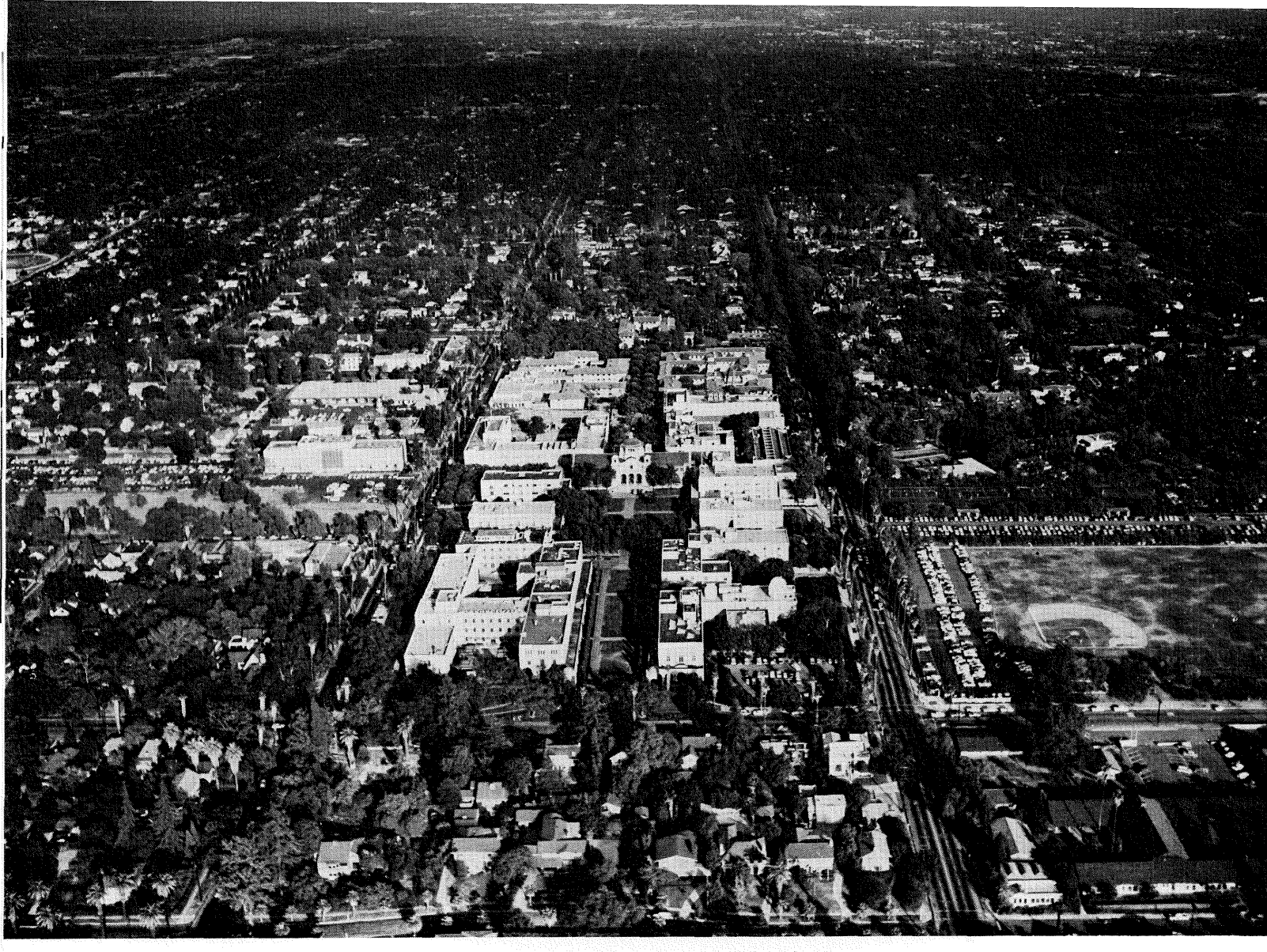
Helicopter view of the campus, October 9, 1961.