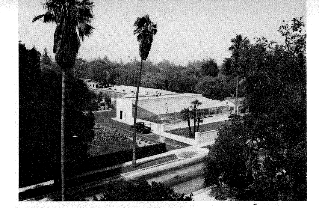
Campbell Plant Research Laboratory