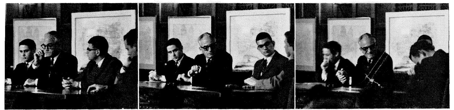
ty members during his visit to the campus on the YMCA Leaders of America program.