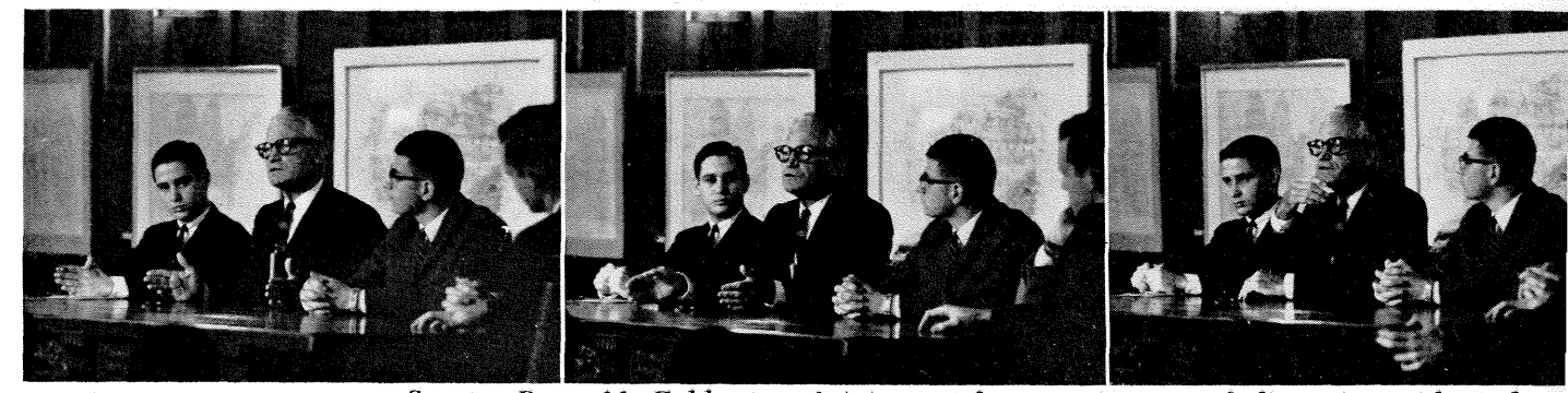
Senator Barry M. Goldwater of Arizona takes part in a panel discussion with students