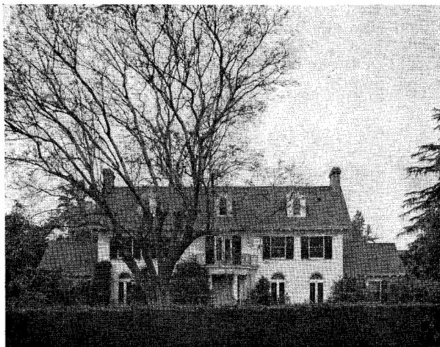
New home for the Industrial Relations Center, next to the President's house on Hill Avenue.