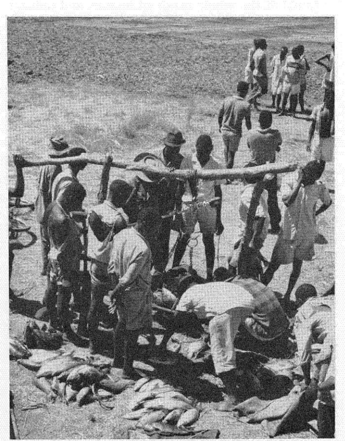
Fisheries were one of the few planned projects at Kariba Lake. The impressive results show how much human potential exists. These Tonga now enjoy a much higher standard of living, and they have become valuable members of the national economy.