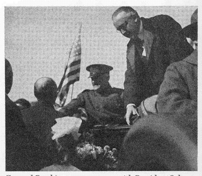
General Pershing tours campus with President Scherer.

In the autumn of 1918 Throop College started training enlisted men in the nationwide Students Army Training Corps program. Under the SATC, in which 500 colleges participated, all students over 18 became "enlisted members of the military forces." A mess hall and barracks to accommodate 300 men were erected on campus, and on October 1, 1918, the Throop College unit of the SATC officially began operations.