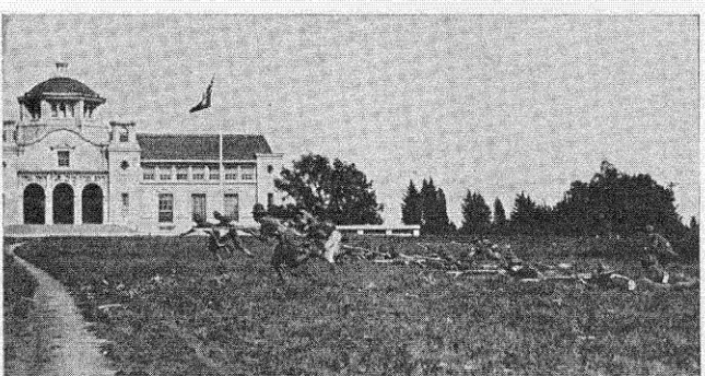
The Student Army Training Corps on Throop campus.

cent developments having transformed it from a college of primarily local significance into a scientific school of national importance."