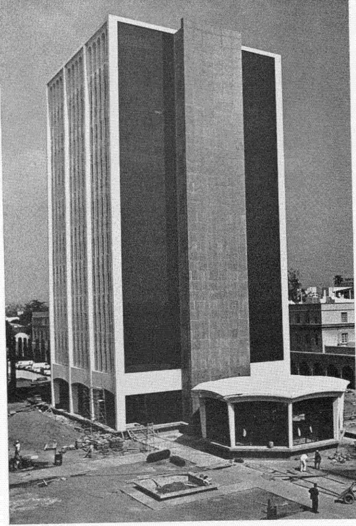
The new library in the final stage of construction.