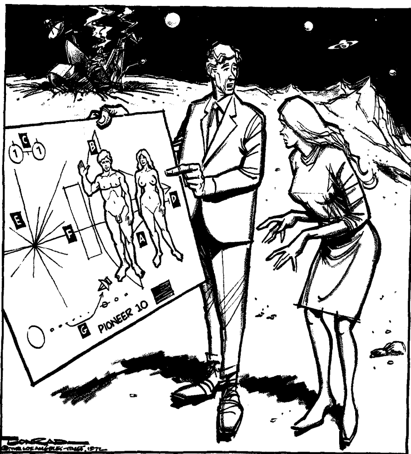
Courtesy of Paul Conrad and the Register and Tribune Syndicate

Then, if we really want our celestial neighbors to know how far we have progressed intellectually, we should have included pictures of Santa Claus, the Easter Bunny, and the Tooth Fairy."