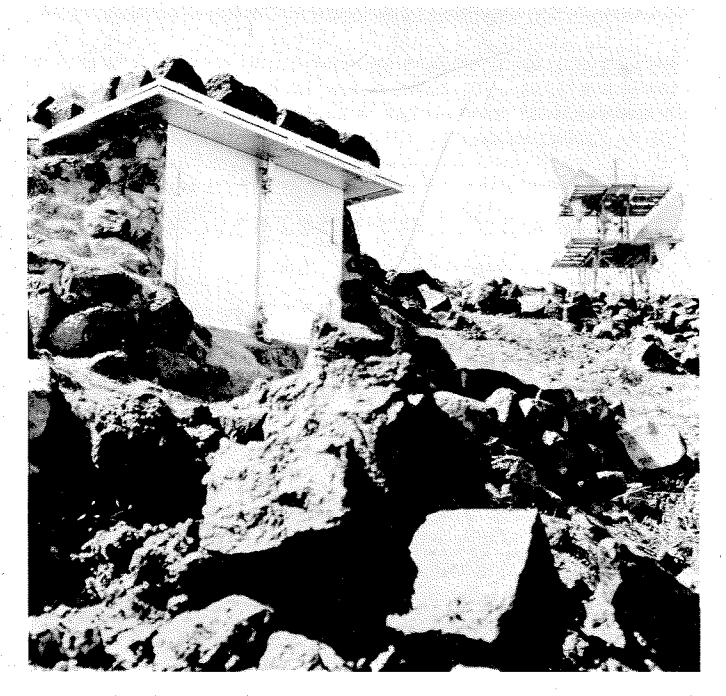
A Caltech telemetered seismometer vault, with an AT&T microwave repeater station in the background, at station GLAMIS, near the California-Arizona border north of Yuma.

Partly because of these logistical problems-the necessity for daily servicing and the maintenance of radio receivers at each station-almost all of the network expansion since 1966 has been with equipment that continuously telemeters signals to Pasadena, using a frequency-modulated tone on leased telephone lines or by radio links. In this way, the size of individual stations can be reduced to a simple buried box (right, above), and the time code can be added to all signals together at Pasadena. In addition-and perhaps most important-the signals are immediately visible in Pasadena, so that an earthquake can be located as rapidly as the data can be processed. One of our principal projects at the moment is to feed the telemetered signals directly into a computer on a real-time basis, so that an earthquake location and magnitude can be automatically obtained within a few seconds of the event. Preliminary results suggest that this should be possible within the near future, utilizing the Seismological Laboratory's new NOVA 1200 "mini" computer (right).