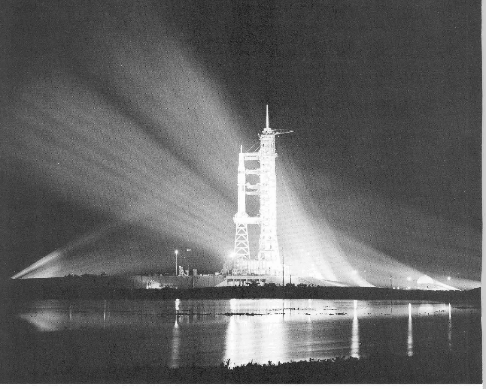
The Apollo-Saturn—ready and waiting.