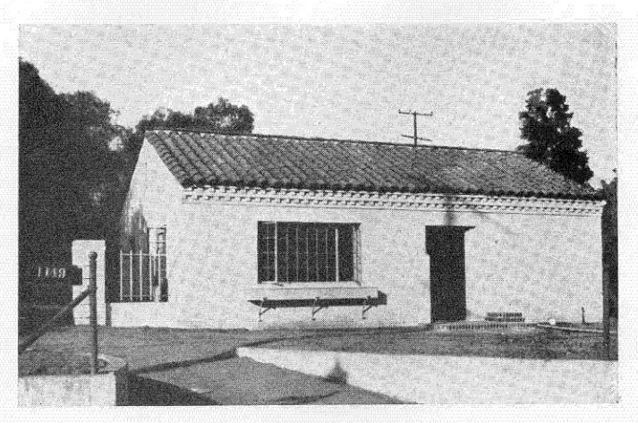
THE PLANT PHYSIOLOGY LABORATORY

In 1935 a program was initiated for finding still other hormones involved in the regulation of different phases of plant growth. As a result of this work it was found that vitamin B_1 is an essential factor in the growth of roots. In the normal plant vitamin B_1 is synthesized in the green leaves and is then