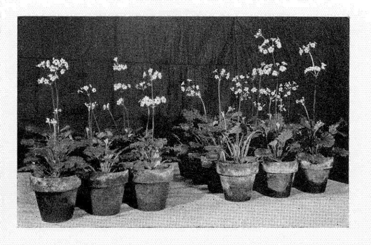
Primula malacoides with and without Vitamin B1 after 6 weeks.

It may seem from the preceding that work in plant physiology at the Institute has centered on subjects capable of immediate practical application. It is indeed true that practical uses have