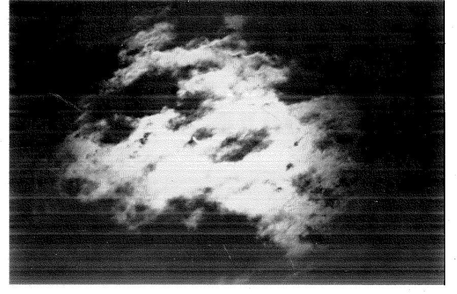
A tiny sliver of solar crescent shows through the broken clouds as the eclipse of the sun nears totality. Puri, India, February 16, 1980.

demons who will wreak havoc upon the earth during the period of totality.