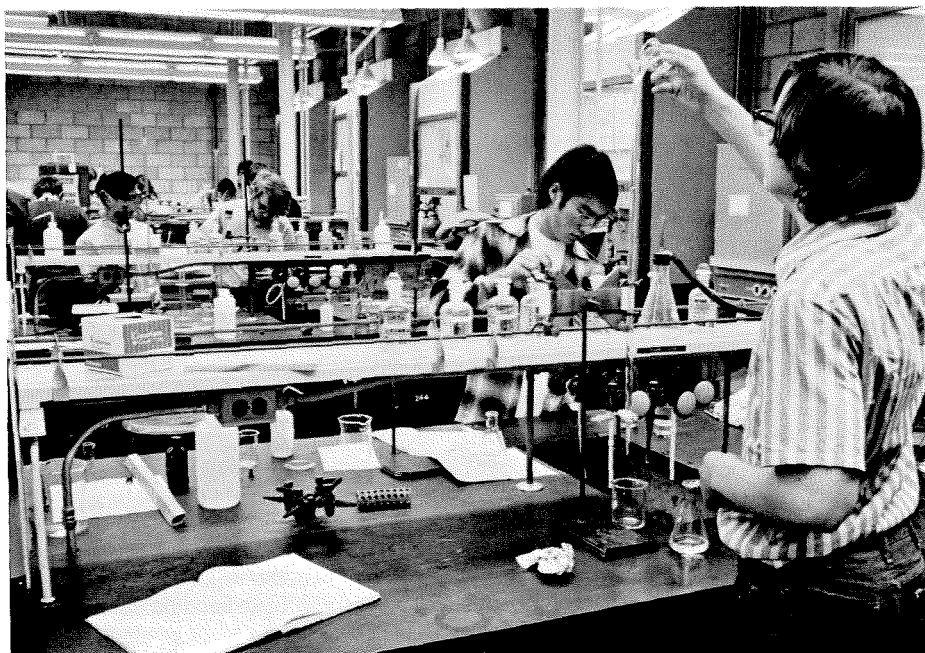
After being scattered over the campus for the last year, the freshman chemistry labs are back in one place.

After 52 years of service to freshman chemistry, Gates finally stands vacant. Present plans call for reinforcing the building to bring it up to safety standards, and remodeling the inner structure to serve as needed office space.