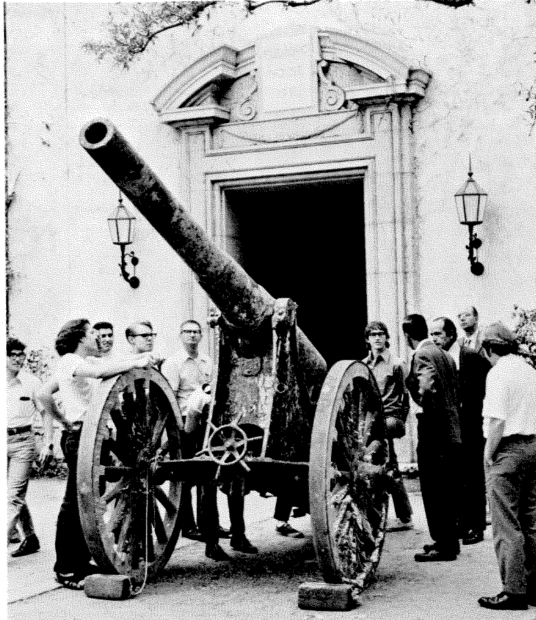
When Fleming House picks up a trophy, they do it in a big way.

The Caltech seniors thought well of the school at which they had studied for four long years: 91% felt that they were "not treated as numbers."