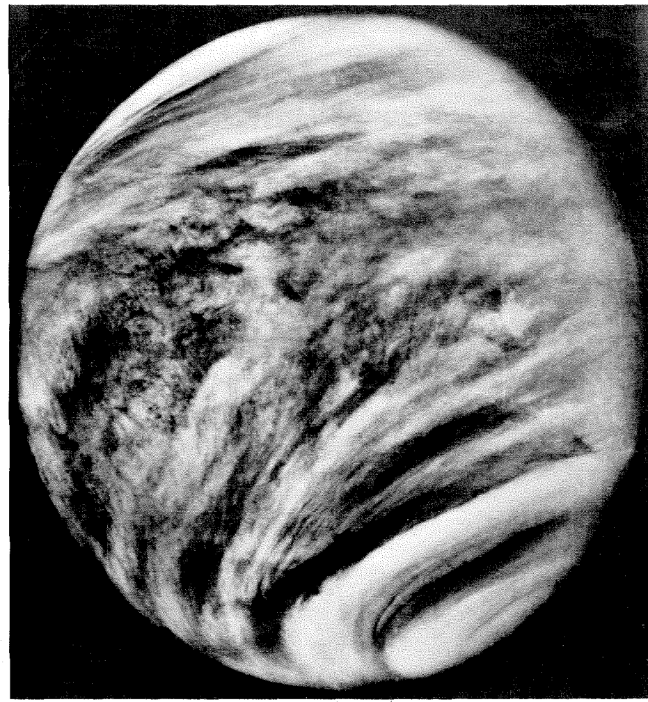
appearance as seen from an Earth-based telescope (left) and from Mariner 10.

As Mariner 10 flew by Venus at a distance of 453,000 miles, it snapped this picture of