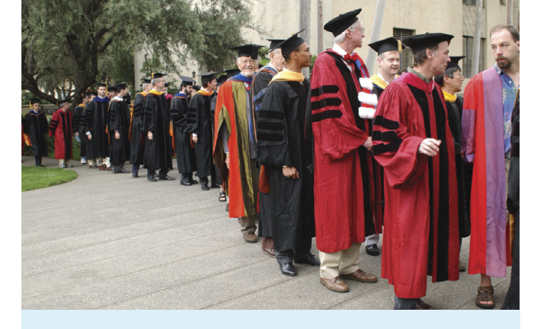
OTHER HONORS AND AWARDS

The faculty files—into Commencement 2003.