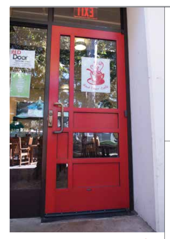
The RED DOOR CAFÉ

tell us about their favorite spaces at Caltech. Here is what some of them had to say.