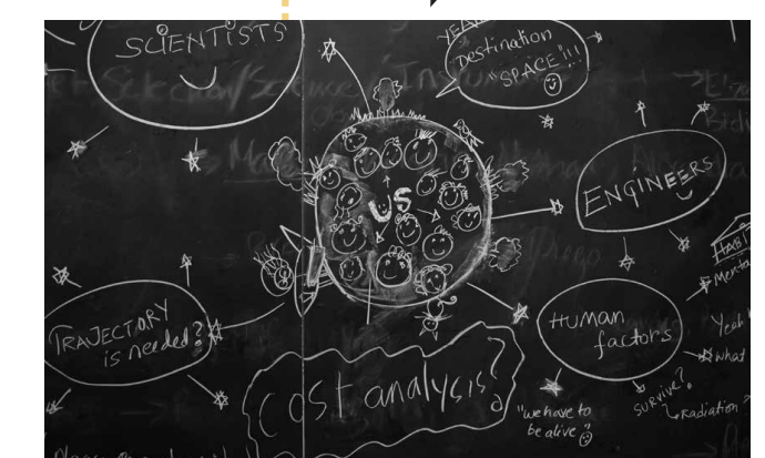
14 ENGINEERING & SCIENCE WINTER 2014

The Keck Institute for Space Studies was established with a $24 million grant over eight years from the W. M. Keck Foundation. It is a collaborative venture with JPL, which supports its participation in KISS programs with significant funding from its Research and Technology Development program.