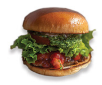
Decompression! It meant finals, but it also meant free food! Vivian U (BS '06) WALNUT, CA