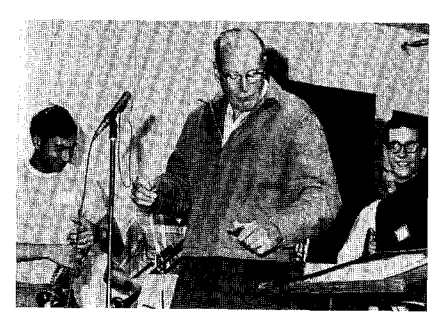
Directing the band at Freshman Camp

publication, that the students get that much time and energy devoted to them.