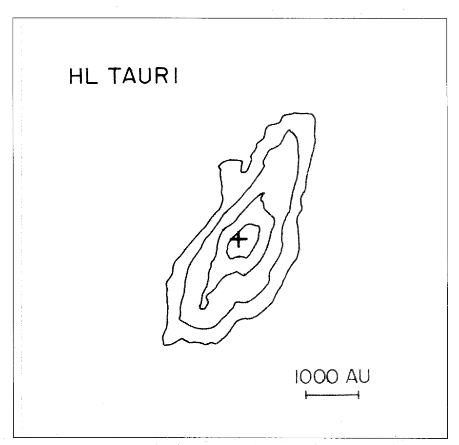
Five hundred light years from earth, the star HL Tauri (at the cross in this illustration) is surrounded by a large disk of gas and dust. Recent studies with the Owens Valley Millimeter Wave Interferometer have revealed that this disk orbits in accordance with Kepler's laws of planetary motion.

The carbon monoxide molecules in the gas disk, on the other hand, emit radio waves at specific frequencies. Because of the Doppler effect, these emissions are shifted to longer wavelengths as the gas recedes from us and to shorter wavelengths as it approaches. By measuring the degree of shift in the wavelength of the radio emissions, Sargent and Beckwith determined that the pattern of velocities in HL Tauri's circumstellar disk is the same as the pattern we see among the planets of our own solar system, where