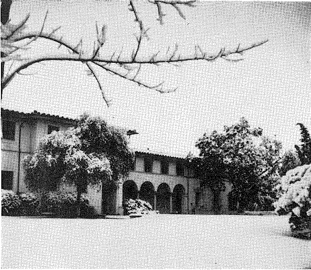
Student houses got their share of Pasadena's four-inch fall.