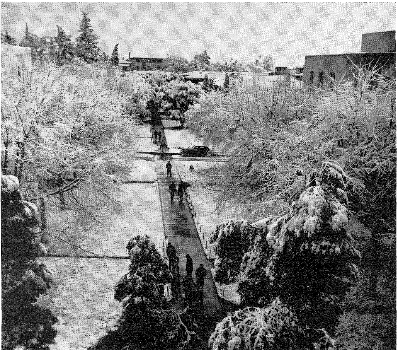
Olive trees between Throop and Athenaeum had an unfamiliar look. So did one student who appeared in a raccoon coat.