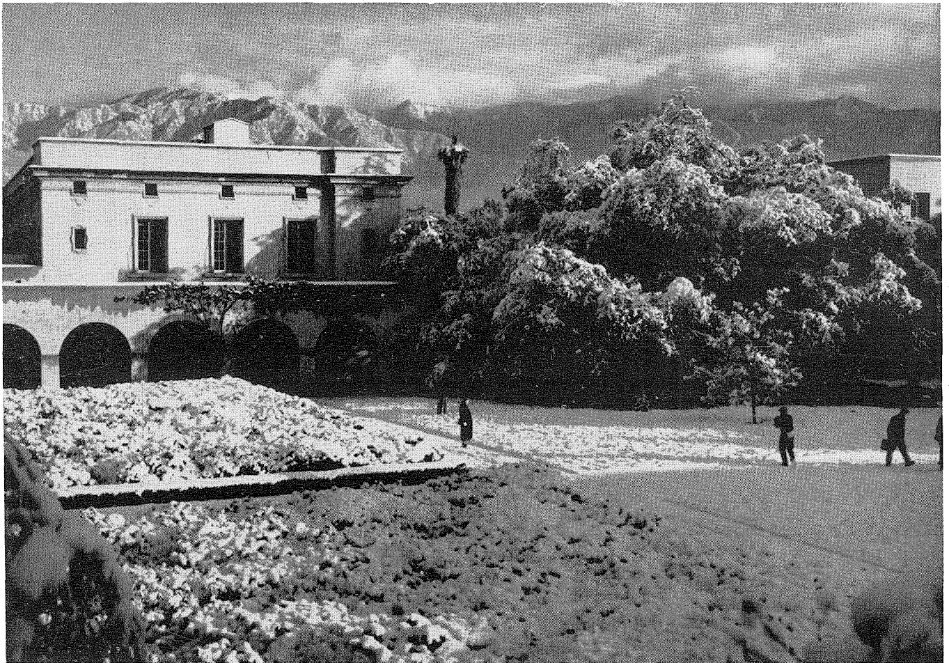
On January 11, morning after the big "blizzard," Caltech's campus and mountains looked like a New England winter scene.