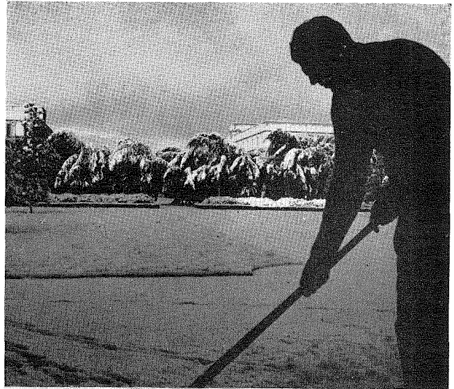
Shovelling out wasn't very hard; but, still, it was necessary.