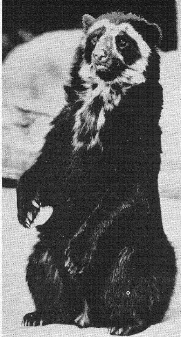
FIG. 3. Spectacle bear ( Tremarctos ornatus ) from Guayaquil, Ecuador. Note color pattern on face and chest.

A comparison of the assemblages of mammals exhumed from the Pleistocene asphalt deposits of Rancho La Brea and McKittrick with that living in California today emphasizes the paucity of the present fauna. The difference displayed by our existing life results largely from the disappearance or extinction of many of the characteristic types of Pleistocene mammals. To less extent is this due to the appearance of new specific types. Thus, while black bears and grizzlies were present in the Californian region during the Ice Age, and the former at least is definitely known to be specifically different from the black bear of today, the most striking feature of an earlier history of the bear group is the existence in California during the Glacial Period of an extinct short-faced bear unrelated to the black bear and grizzly. In contrast to the disappearance of the grizzly in California, the extinction of the