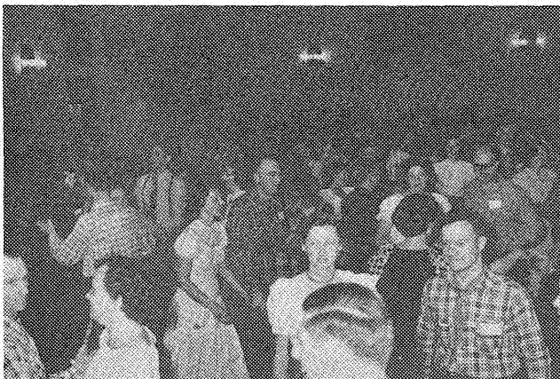
Alumni square dance — at one of its more placid points.