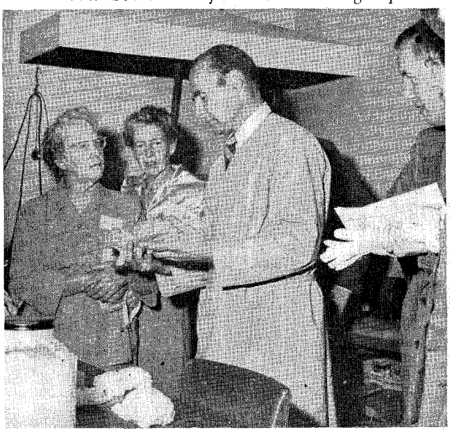
Open house: Vertebrate Paleontology lab