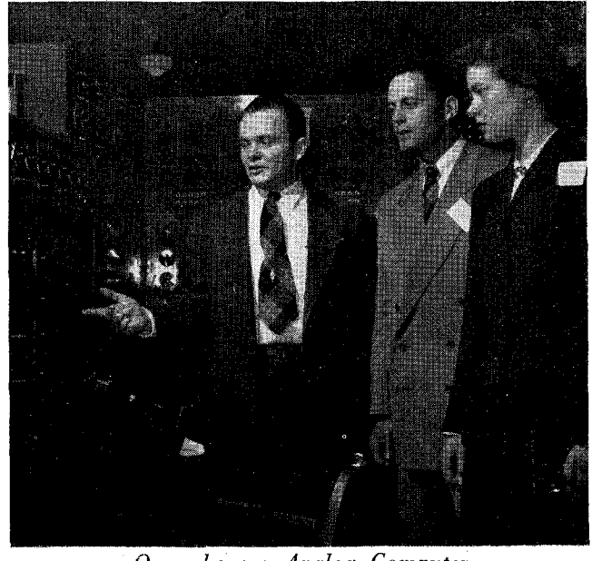
Open house: Analog Computer