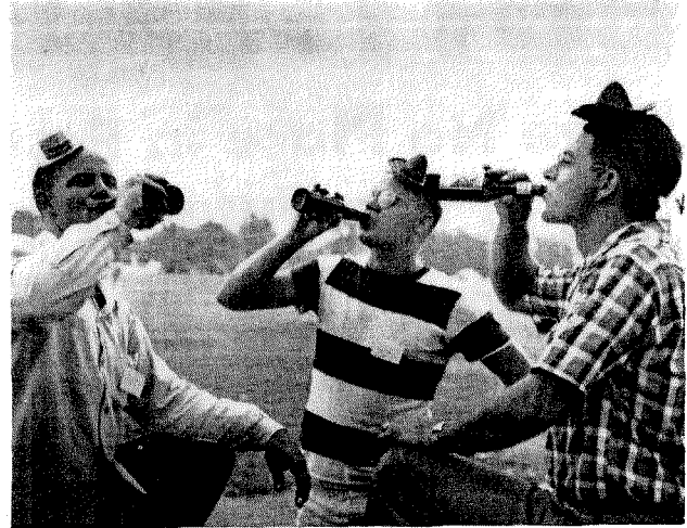
Typical scene at the 1950 Alumni Association Field Day, which was held this year in Tournament Park on July 8.

Looking ahead to next spring—Save April 14 for the Alumni Seminar on campus.