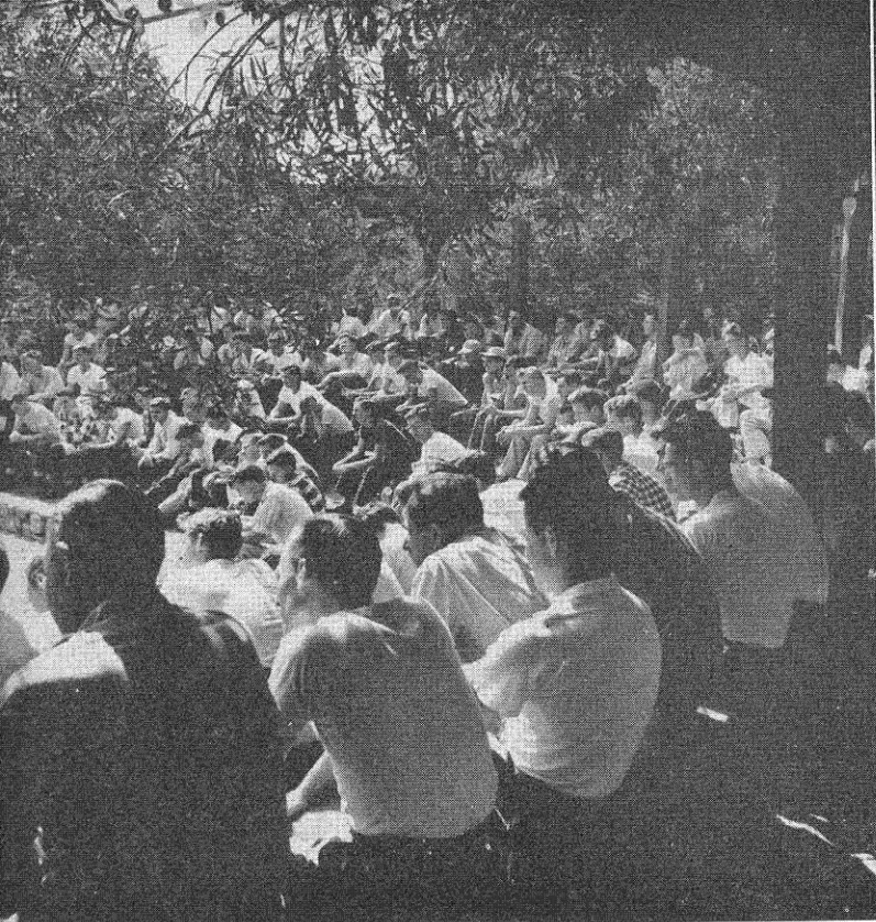
Attentive audience listens to faculty talk in stone amphitheater.