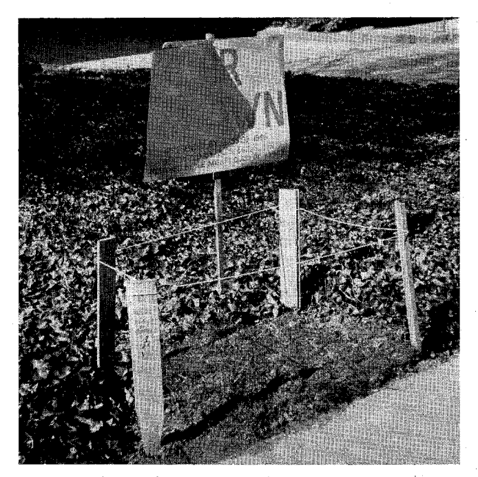
Senior lawn—restored for Ditch Day

By noon the troops arrived at the Corona beach to unload Larry Knight's big truck of its five beer kegs, endless quantities of hamburger, potato salad, and eating paraphernalia, then proceeded to tan their collec-