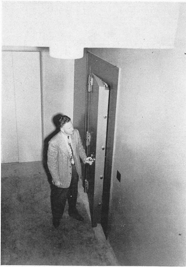
Door to outer vault of Huntington Library's new bomb-resistant structure is solid steel, three inches thick.

T HE BOARD OF TRUSTEES of the Henry E. Huntington Library and Art Gallery has always been keenly aware of its obligation to the public to do its best to protect the rare books, manuscripts, paintings, and other art objects in its custody. During World War II, when air attacks on southern California seemed imminent, some of the more valuable articles were removed to distant places.