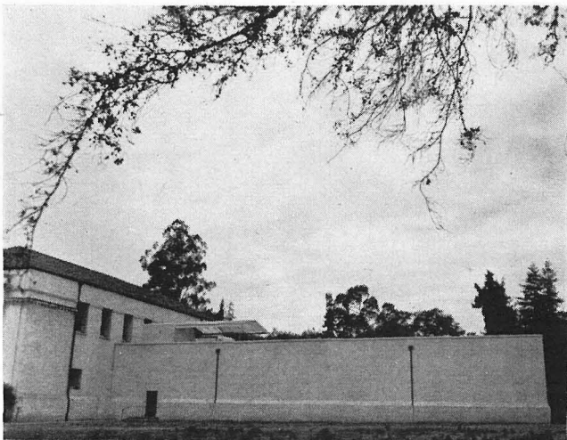
East elevation of the structure shows its relation to the main library building. The roof deck at the left is used as an employees lounge.

number of bombs follow a path in the earth which resembles a J. This fact makes it imperative that all surfaces, including the bottom, have approximately the same thickness of protection. Otherwise a near miss could easily penetrate to a level below the side wall and turn upward to pierce the bottom slab.