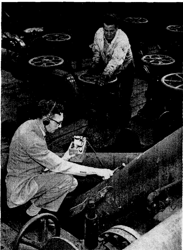
Workers at California Research Corp. monitor a pipeline to detect presence of radioactive material

It is obviously impossible to detail the hundreds of uses of isotopes. This cross-section sampling, however, should give some indication of the sensitivity, versatility, performance and promise of this revolutionary new research tool.