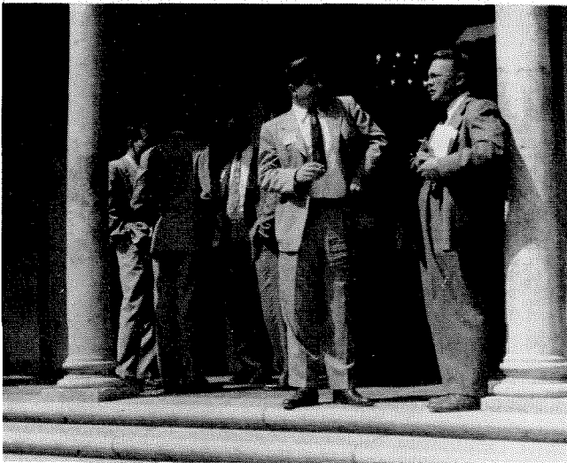
Taking time out to swap vital statistics