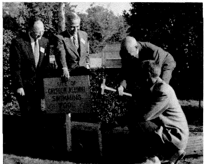
Breaking ground for the Alumni Swimming Pool