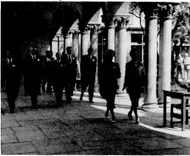
Full day's program kept visitors on the move