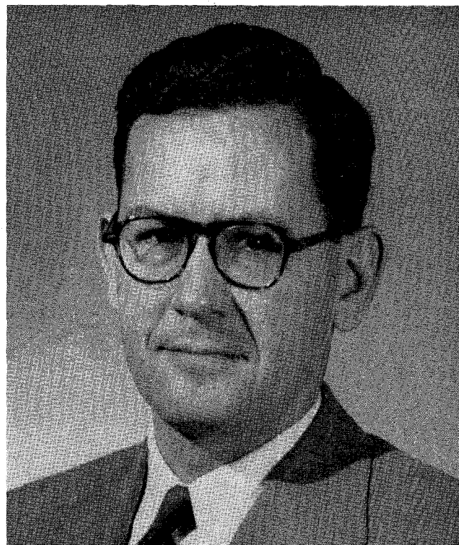
John D. Roberts, Professor of Organic Chemistry