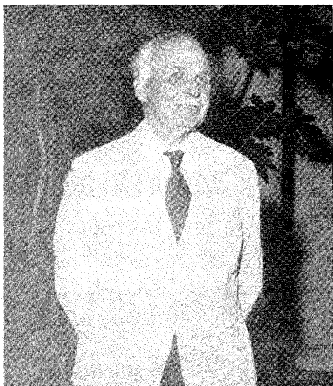
Sir Lawrence Bragg, Visiting Professor of Chemistry

Said President DuBridge: "In the passing of Edwin Hubble the world has lost one of its greatest astronomers; and Pasadena has lost one of its greatest citizens. He will be missed by scientists the world over—most of all by his colleagues at Caltech, at the Mount Wilson and Palomar Observatories and the Huntington Library. To them he was not only a great scientist but also an irreplaceable friend."