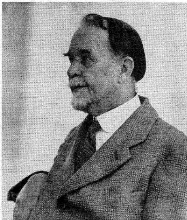
The late Thomas Hunt Morgan—1933 prize in medicine