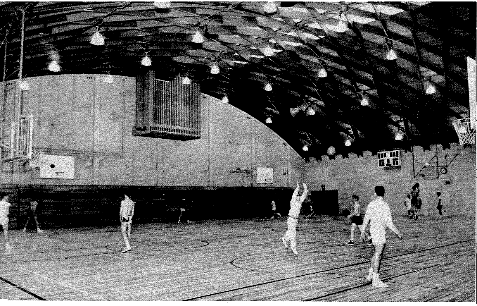
Cym floor is large enough for two practice basketball games to be played simultaneously on its cross courts.

CALTECH'S IMPRESSIVE, and long-awaited, athletic center opened for business last month. The Scott Brown Gymnasium was dedicated on January 11, between the halves of Caltech's first home game of basketball, with Long Beach State. The Alumni Swimming Pool, which is also now in use, will be officially dedicated on Alumni Seminar Day, April 16.