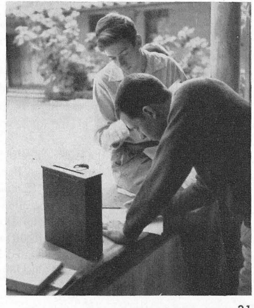
Informed voter casts his ballot