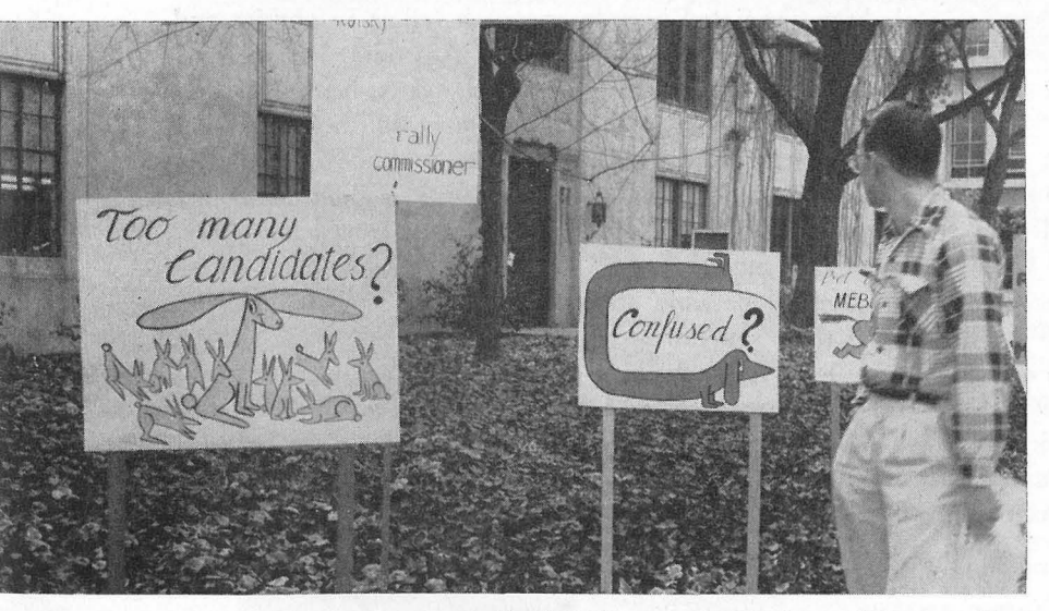
Confused voter weaves through Poster Alley