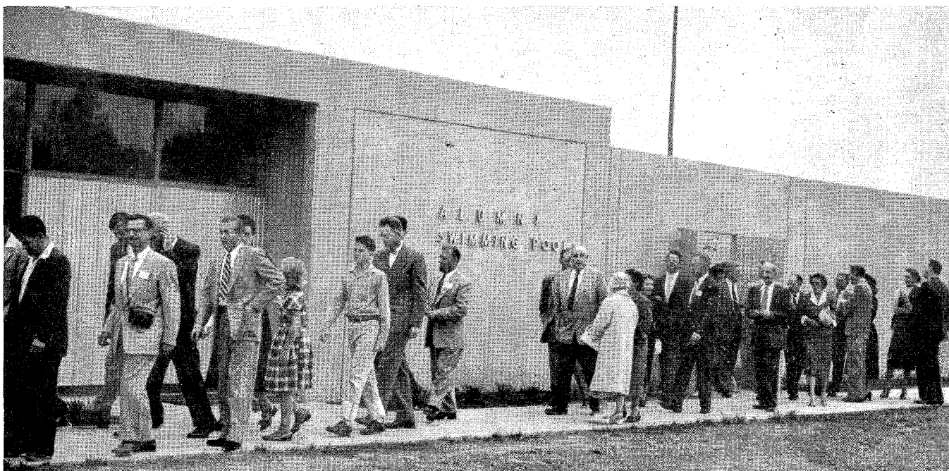
A near-record crowd of 628 alumni, their families and guests, attended this year's seminar.