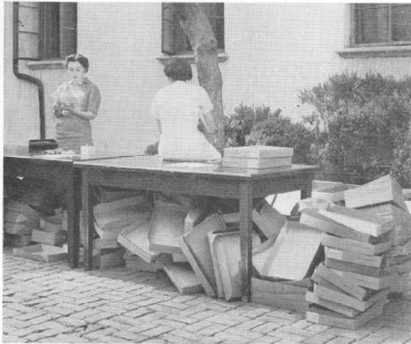
The cap-and-gown concession relaxes after a rush of business.