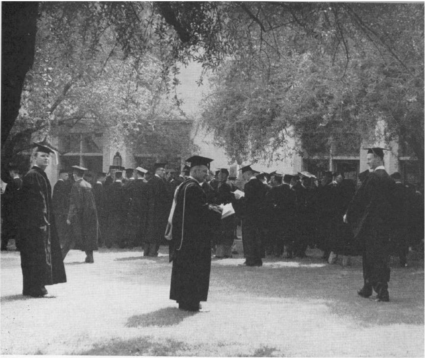
Getting set for the ceremony—students, above, and faculty, below.