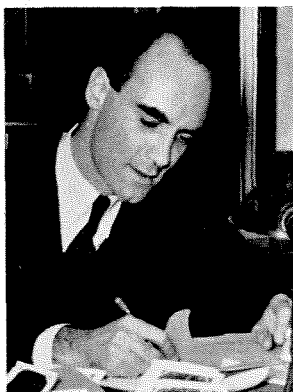
CARL D. ANDERSON B.S., 1927; Ph.D., 1930 Associate Professor of Physics