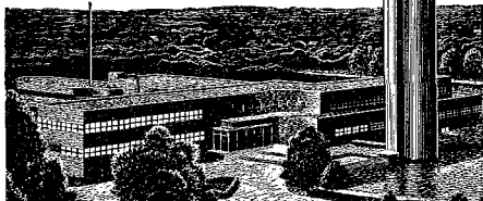
East Coast Laboratory and Microwave Tower

A Division of International Telephone and Telegraph Corporation 500 Washington Ave., Nutley, N. J. 28 minutes via bus from N. Y. C.