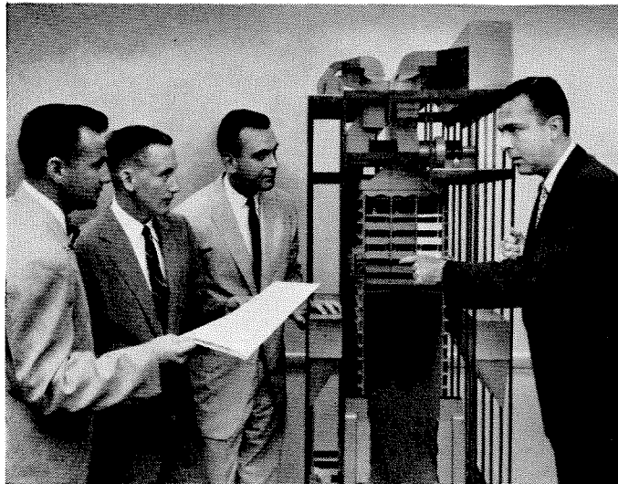
B&W engineers discuss developments in the Universal Pressure Boiler.

Ask your placement officer for a copy of “Opportunities with Babcock & Wilcox” when you arrange your interview with B&W representatives on your campus. Or write, The Babcock & Wilcox Company, Student Training Department, 161 East 42nd Street, New York 17, N. Y.