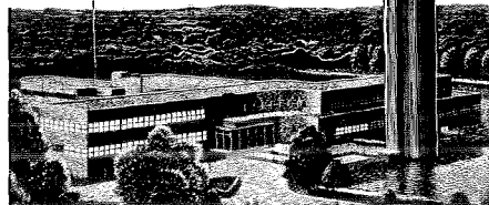
East Coast Laboratory and Microwave Tower

A Division of International Telephone and Telegraph Corporation 500 Washington Ave., Nutley, N. J. 28 minutes via bus from N. Y. C.