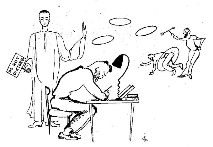
Conscience overcomes mypoia

by induction to a closed neighborhood not including the identity element."