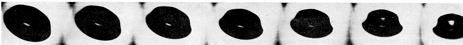
Collapsing bubble photographed by the ultrafast Ellis camera in a few thousandths of a second

The camera has its own lighting system. A tremendous amount of illumination is required to expose film at such rapid speeds. A flash lamp is used that gives 60 times more total light than the most powerful flash bulb. About 6,000 volts of electricity are needed to achieve this brightness and the light is sustained